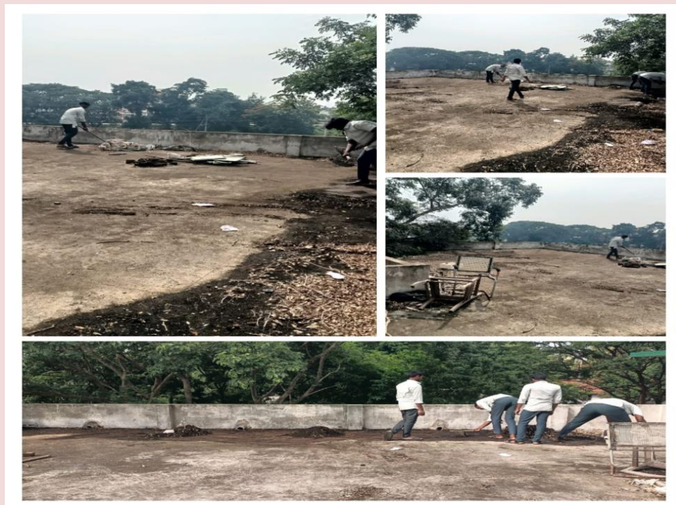
Clean and green activity by students and staff